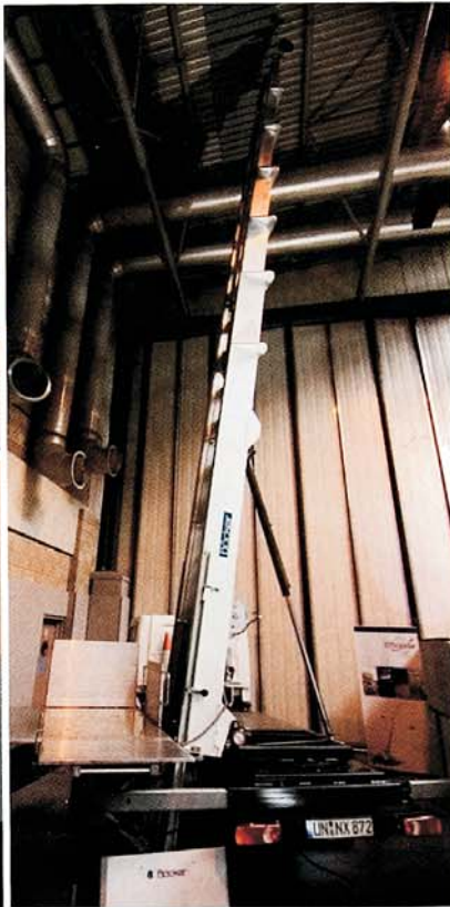
▲ Top: James Removals' eye-catching MAN. Above: Simply Store. Right: Böcker Agilo lift.

SBS Removals, from Sheffield, has increased its operating flexibility with a Wilson trailer. Although much of its work is carrying removals containers, it also has a contract to move new wheelie bins as well as undertaking more general ad hoc work, and the double-decker is versatile enough to cope with it all.