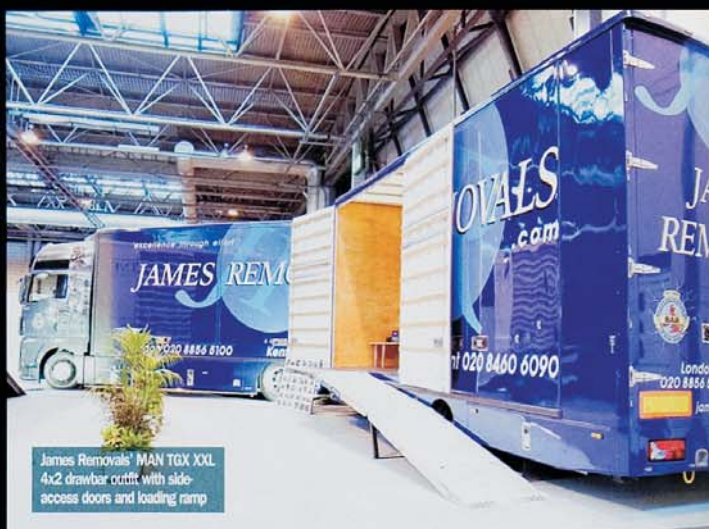
James Removals' MAN TGX XXL 4x2 drawbar outfit with side access doors and loading ramp