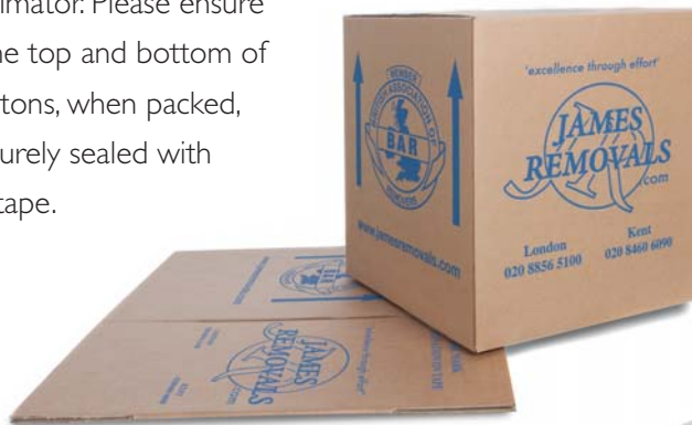
Boxes supplied flat

These will be delivered to you in good time before you move following your discussions with our estimator. Please ensure both the top and bottom of the cartons, when packed, are securely sealed with parcel tape.