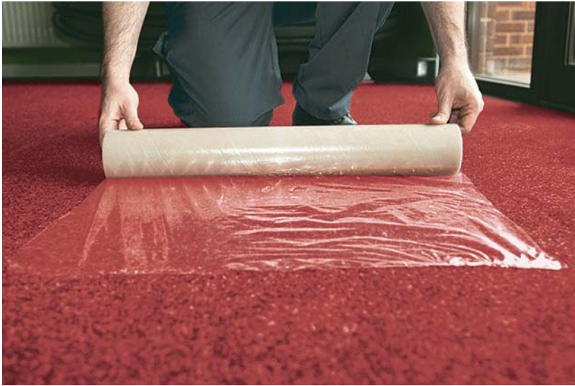
Self-adhesive carpet protection