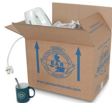
Kettle and mugs – the last items to pack!

View our information videos at jamesremovals.com