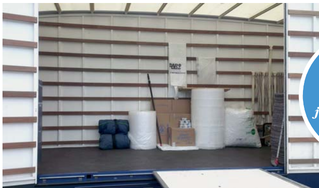
Packing materials in the lorry, ready for your move

And, finally... we wish you the best of luck and lots of happiness in your new home.