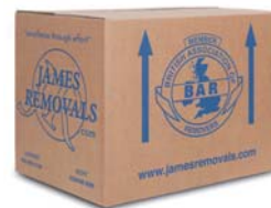
18" x 12" x 12"

To ensure you have the appropriate boxes for your items please note that we supply them in two different sizes.