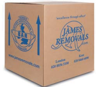
18" x 18" x 20"