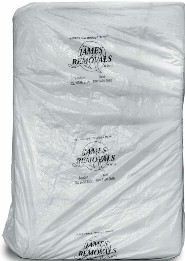
New wrappers are supplied for each mattress